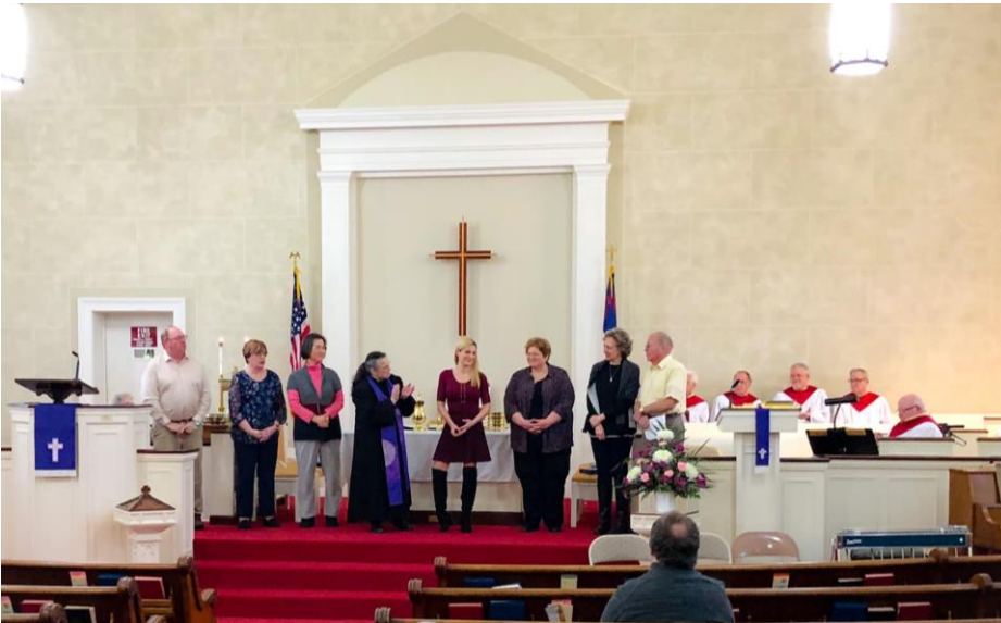
The newly-elected PNC.