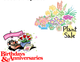
Birthdays & Anniversaries